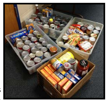
Food donations from students and staff over the last 24 hours