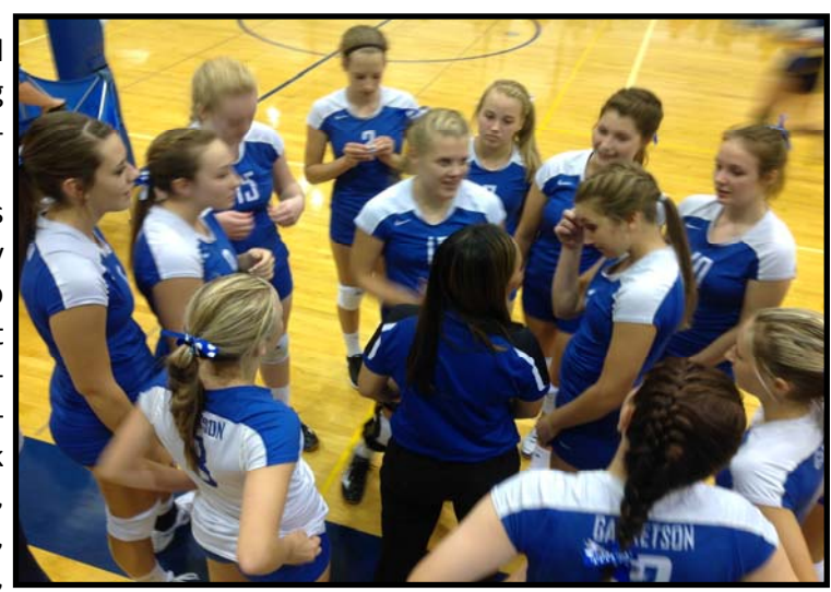
Peyton Lady Blue Dragons in the huddle preparing for their upcoming set